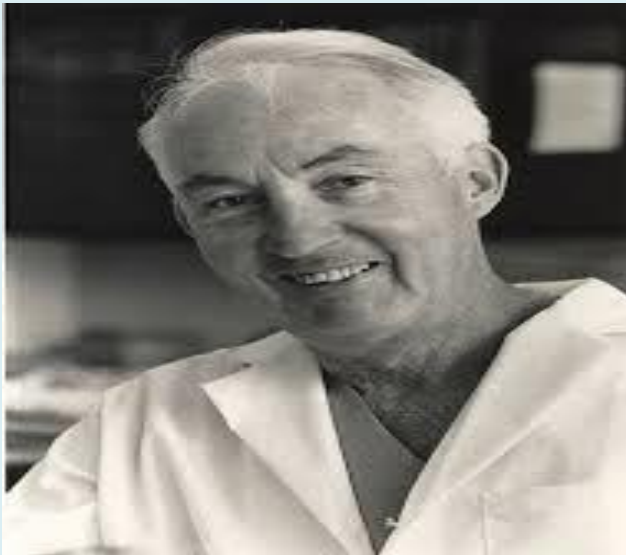
Norman Shumway MD, PhD. The father of heart transplantation and one of the pre-eminent heart surgeons of his time.